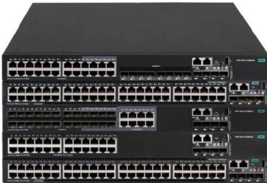
HPE Networking Comware Switch Series 5520 HI

These switches deliver faster performance and advanced L3 features with support for larger ARP/MAC tables and Longest Prefix Match (LPM). VXLAN and EVPN enable multitenant isolation and greater scalability; high availability and resiliency provided by Distributed Resilient Network Interconnect (DRNI), Intelligent Resilient Framework (IRF), Virtual Router Redundancy Protocol (VRRP), Equal-Cost Multipath (ECMP) and Bi-directional Forwarding Detection (BFD). Real-time network health, network and switch performance and visibility provided with Intelligent Management Center (IMC) and Intelligent Network Quality Analyzer (iNQA). Support for IPv4/IPv6, OpenFlow, and MPLS/VPLS features provides investment protection and eases transition from IPv4 to IPv6 networks.